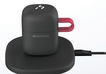
Qi Wireless Charging Base Included

Earbud Weight: 6g/0.2oz. Charging Capsule Wt.: 59g/2oz. Earbud Efficiency: 90dB +/- 3dB 1 kHz Earbud Speaker: 6mm Titanium Film Frequency Response: 20-20kHz Microphone Sensitivity: 42dB +/- 1 3dB Microphone Freq. Resp.: 100-4kHz Earbud Charging Time: 90 minutes Capsule Charging Time: 120 Minutes Charging: DC 5V/1A via USB